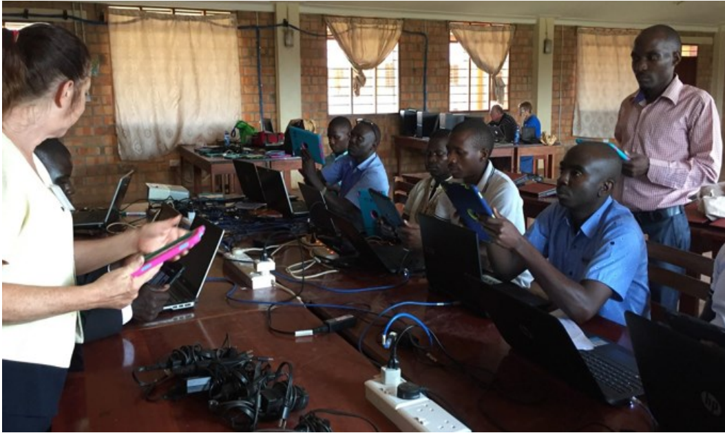
Computer lab at Blessed Trinity High School, Uganda. Teachers learning how to use the technology donated by Ascension and Blessed Trinity Churches.