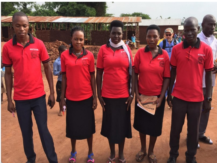
The teachers at Ascension School. Probably, no one has more than a high school education. One of our goals is to get these dedicated teachers more training and do a total make-over of their school.