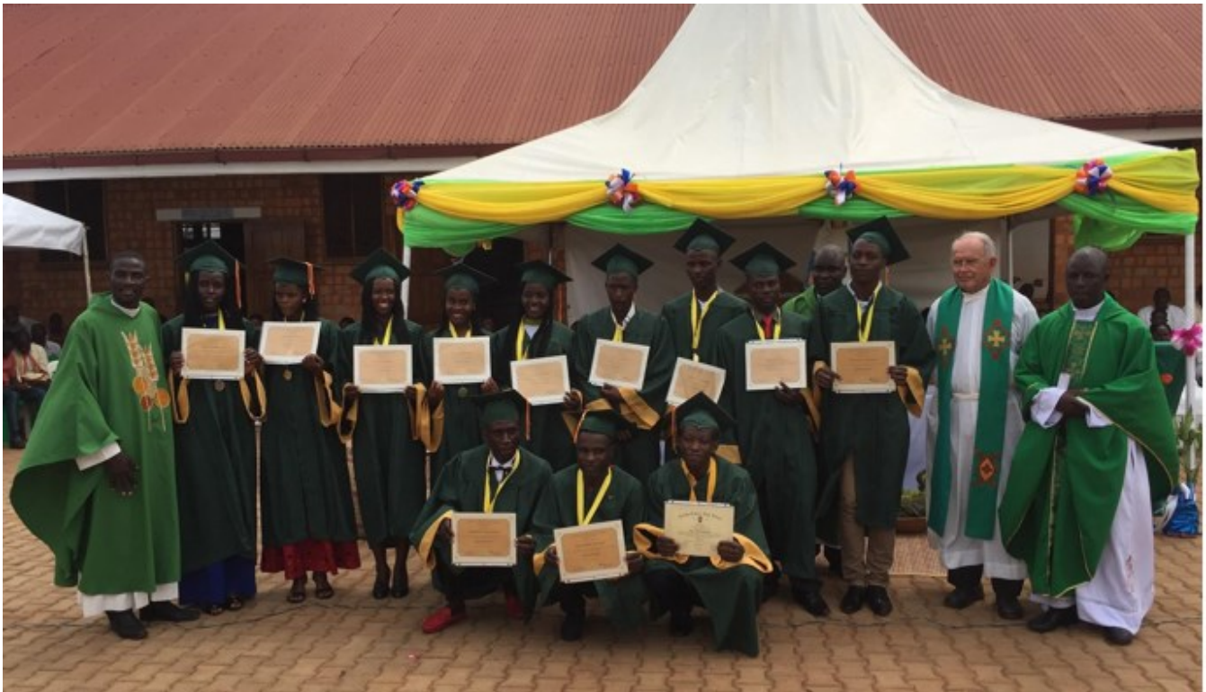
The first graduating class from Blessed Trinity High School. They all began here as primary students. They achieved some of the highest scores in the country on their qualifying exams for universities. Two of the graduating students spent the last school year at Blessed Trinity High School in Ocala