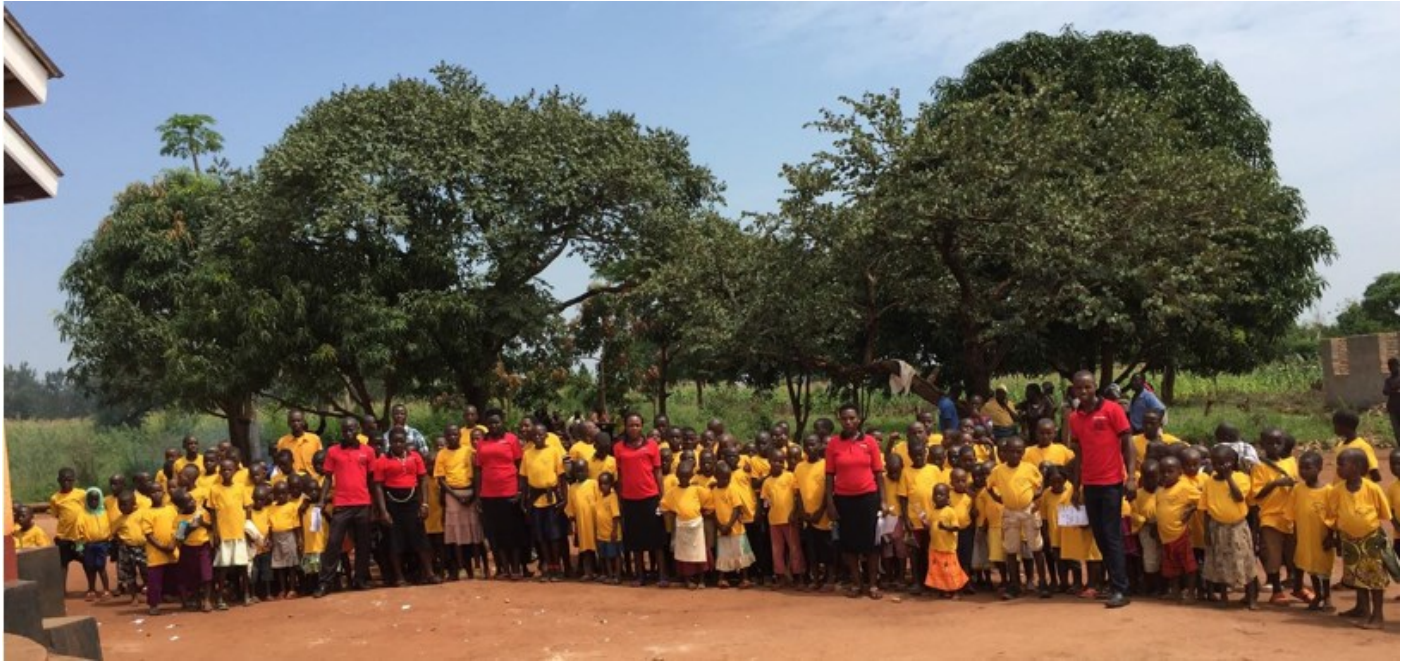
Children at Ascension School Uganda, wearing the uniform tops donated by our Melbourne Ascension School. One of the teachers exclaimed with joy, "Now we are a real school!"