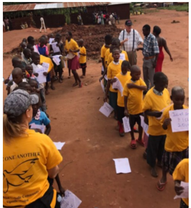
Getting a photograph and name of each of the children at our Sister parish school. Hopefully, we can start a sponsor program for these children. More on this at a later time.