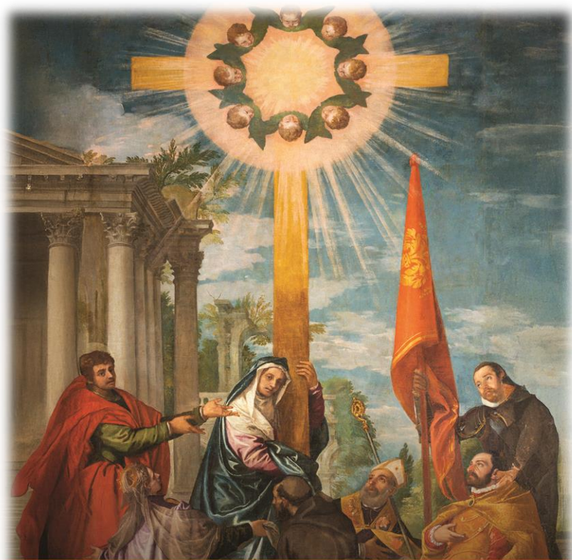
THE EXALTATION OF THE HOLY CROSS

CELEBRATING THE EXULTATION OF THE CROSS SEPTEMBER 14, 2024